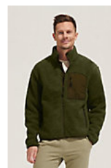
SOL'S FURY 04042