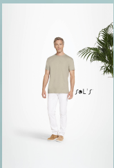
ORGANIC MEN 11980